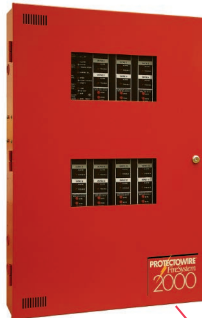
FireSystem 2000 Control Panel

Perhaps as important as these features is the low maintenance aspect of Protectowire Linear Heat Detector. NFPA 72 allows for a non-destructive test of Protectowire, so instead of individual renters being subject to the inconvenience of having to unlock their spaces for inspection or testing of the fire alarm system, a simple end-of-line test switch can be activated to test the integrity of each detection zone thereby reducing costs.