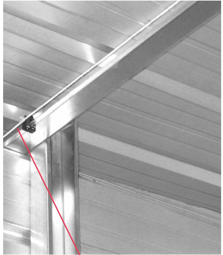
Protectowire Linear Heat Detector

Due to its linear nature, the entire length of Protectowire is a fixed temperature heat detector. This unique characteristic allows the Detector to be installed longitudinally in each building thereby covering each individual storage compartment. To determine the alarm location, a Protectowire FireSystem 2000 Control Panel with Alarm Point Location Meter is used. By referencing the linear distance of the alarm point displayed on the meter to the footage represented in each cubicle as noted on a facility site plan (Figure 1) mounted next to the control panel, the location of the alarm condition can be easily identified. For example, if the system indicates an alarm in Zone 1 and the meter reads 170 feet, one would know that Building A, Space 16 is the location of the alarm source.