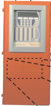
ARIES NETLink Control Panel